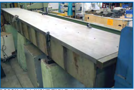
BOSCH HD LAYOUT TABLE 18"X12'X1-1/4"