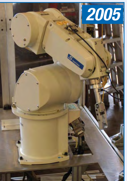
MITSUBISHI 5 AXIS ROBOT, MODEL S SERIES, RU-3SJ-S11