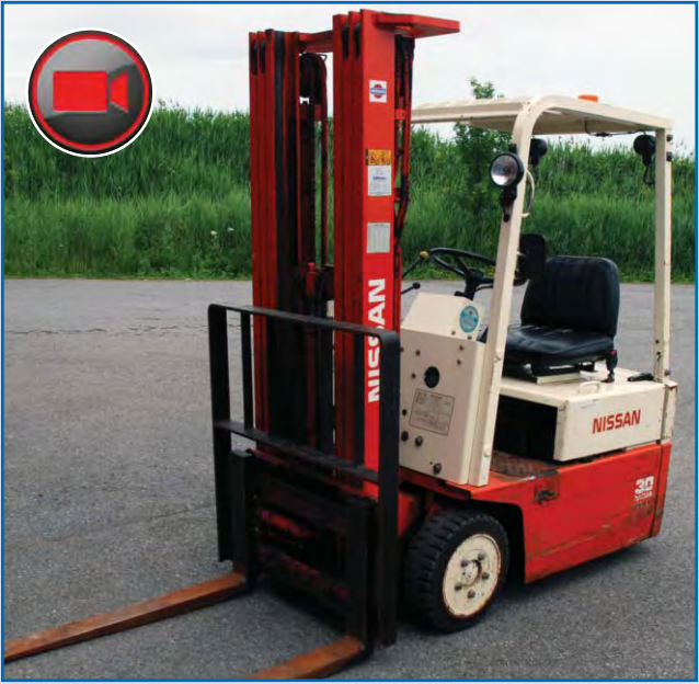
NISSAN 2.400 LB CAPACITY ELECTRIC FORKLIFT. MODEL 30