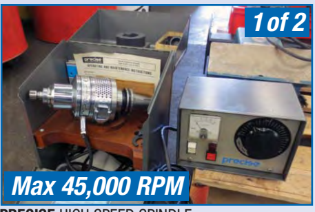
PRECISE HIGH SPEED SPINDLE