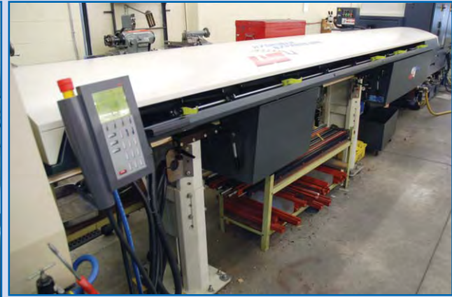
1999 LNS Hydrobar Express 226 Bar Feed, Set of 1-3/4" & 1-1/4" Pushbars & Guiding Channels Included, sn 100237 (Currently Feeding Hardinge)

2000 HARDINGE Conquest ST220B, Swiss Turn, GE Fanuc 18iT Control, Parts Conveyor, Chip Conveyor, Live Tooling, Max Machining Diameter ¾", Max Machining Length 10.35", Main & Back Spindle Speeds 8,000 RPM, Hours 24,936, Main Spindle 5 HP, sn 223-20. View Video On Website!