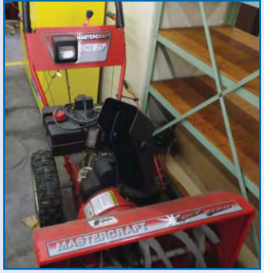
MASTERCRAFT 29" SNOW BLOWER