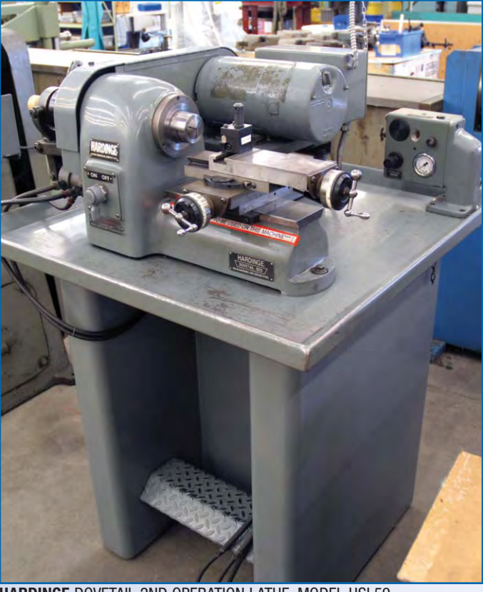
HARDINGE DOVETAIL 2ND OPERATION LATHE. MODEL HSL59